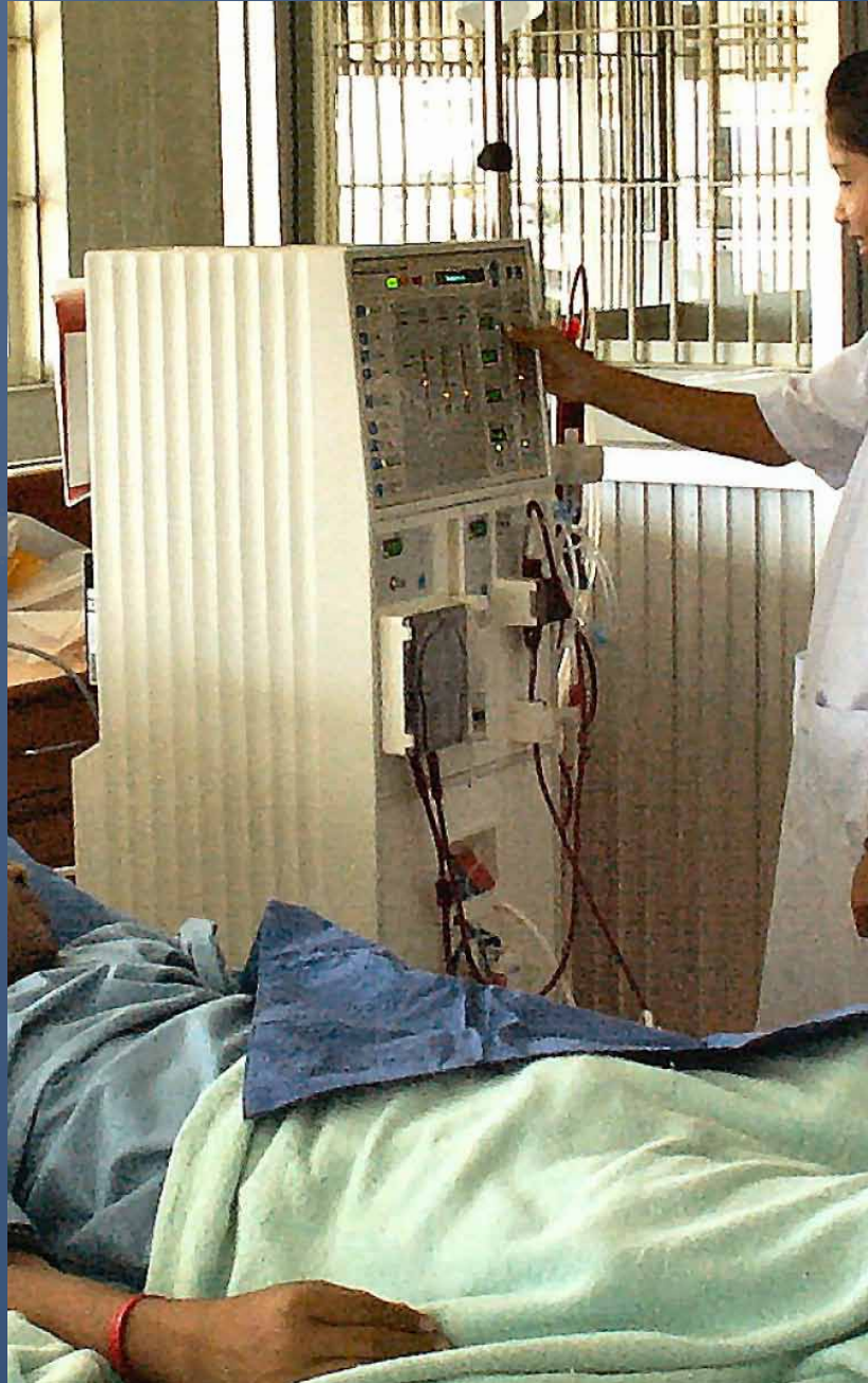
- Treatment of prisoner -