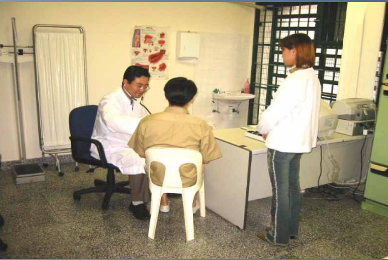
- Medical service provided to inmates in the prison -