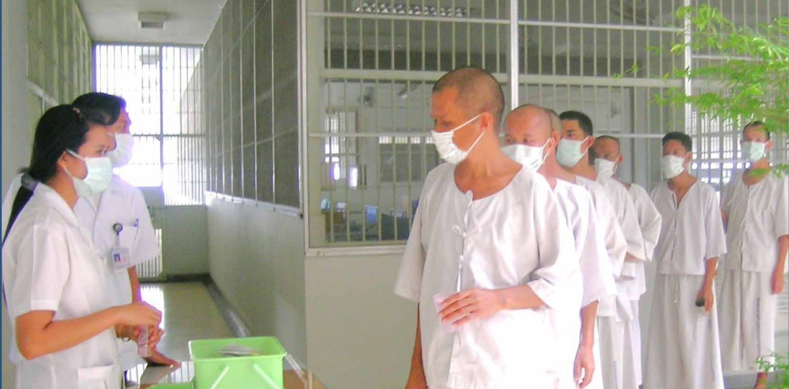
- Both medical staff and prisoners wearing masks as a preventive measure -

are vulnerable places for TB infection as prisoners have to live in cells with poor hygiene and ventilation. The provision for medical treatment for TB infectious prisoners includes Direct Observed Treatment (DOTs) and a short course programme, which has been an implemented therapy in Thai prisons for more than 10 years. Moreover, sputum testing in prisons has been done for discovering new smear positive TB prisoners and infected prisoners are separated to the prison hospital or infirmary. These TB infectious prisoners will attend DOTs programme and receive related treatment until the sputum testing shows negative TB results and the prisoners are no longer TB infective for TB. However, the success rate of TB control in Thai prisons is still not satisfactory due to overcrowding and understaffing problems.