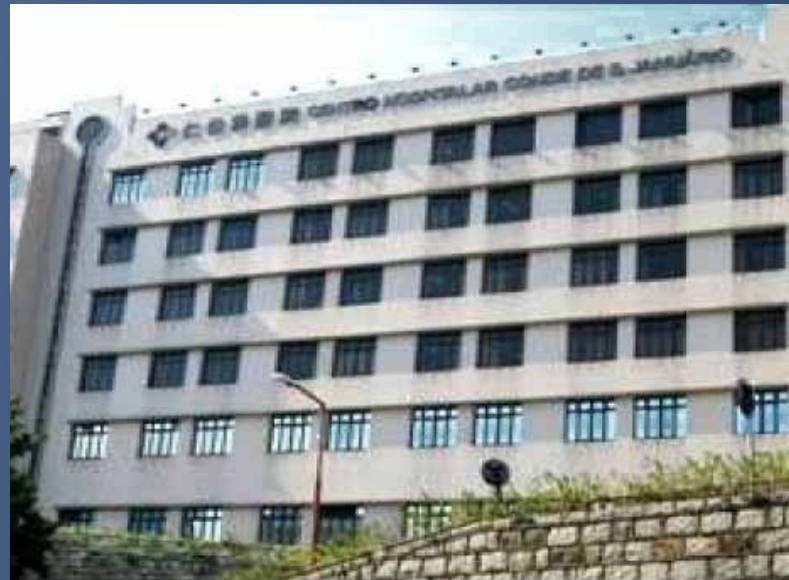
- Government Hospital of Macao -

are to provide both outpatient and inpatient services to inmates who require medical interventions that are available in the public hospital.