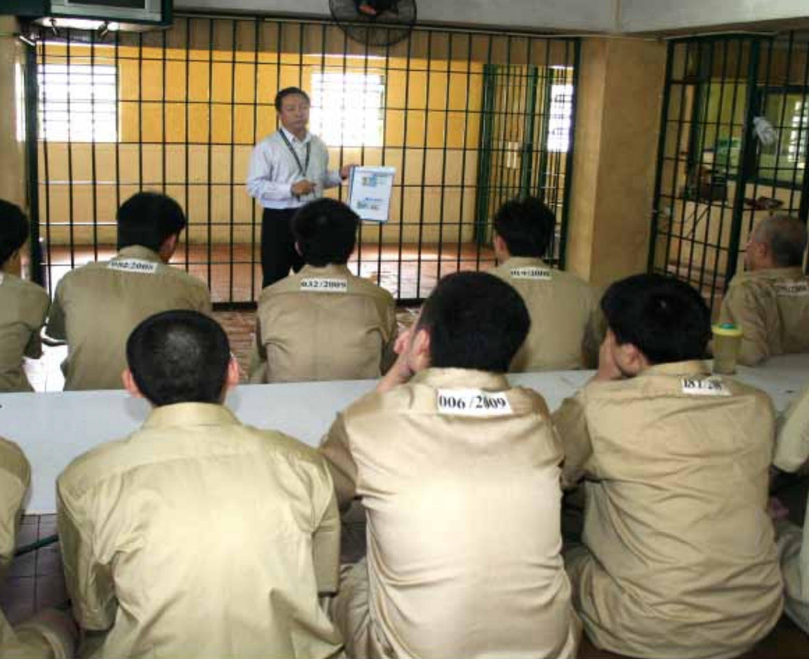
- Seminar for inmates held by prison doctors -