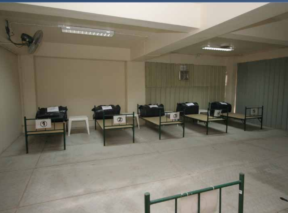
- Epidemic Prevention and Isolation Zone -

To prevent the spread of infectious diseases, the prison has also divided the detention zones into several areas, which include isolation cells, functional cells and Epidemic Prevention and Isolation Zone. Isolation cells are used to house inmates with highly infectious respiratory diseases, such as tuberculosis and high-risk diseases like AIDS that are transmitted through bodily fluids. Functional cells, meanwhile, are established on different floors or in different blocks and would be used as temporary isolation cells in the event of an epidemic.