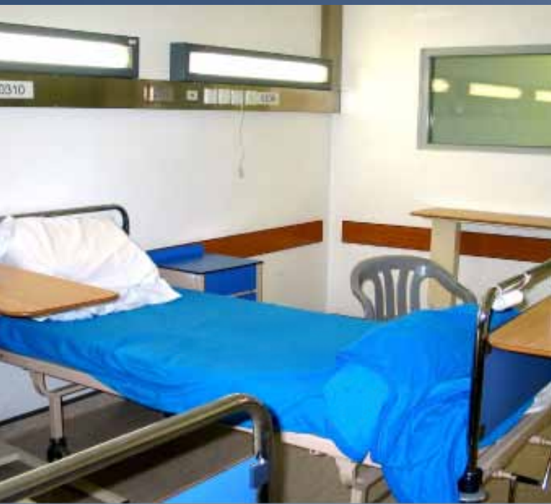
- Custodial Ward -

inmates' bodies have to be checked within 48 hours after their admission. The prison will send their personal information to the Tuberculosis Prevention and Treatment Center and Public Health Laboratory to check their medical and HIV testing records. In addition, new inmates are required to undergo an X-Ray of their chest to check for the possibility of tuberculosis. Other tests administered on them include HIV test, syphilis test, HBsAG test and an anti-HCV test so as to identify these diseases,