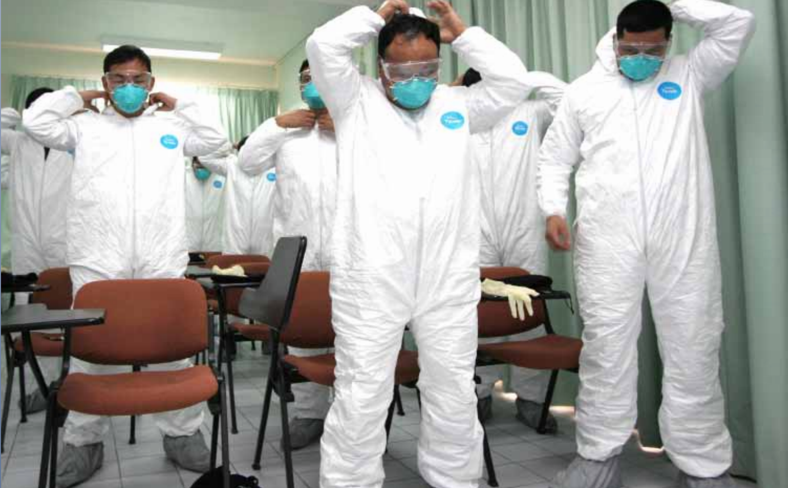
- Prison staff are being trained on how to use protective clothing and equipment -